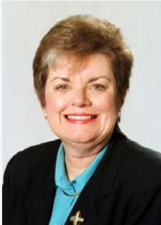
Michigan Supreme Court Justice