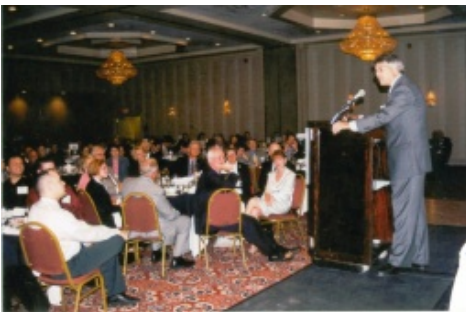
Addressing the State Bar audience.