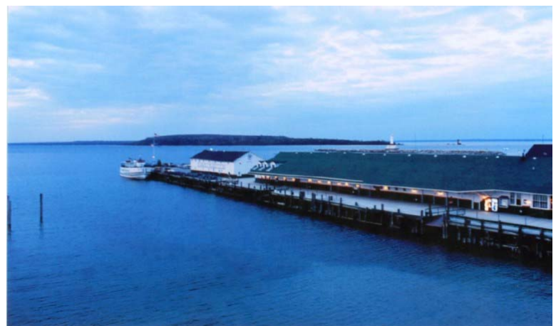
Blue Morning Wharf—a view from the Chippewa Hotel