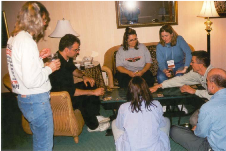
RAM Members play a rousing game of Euchre