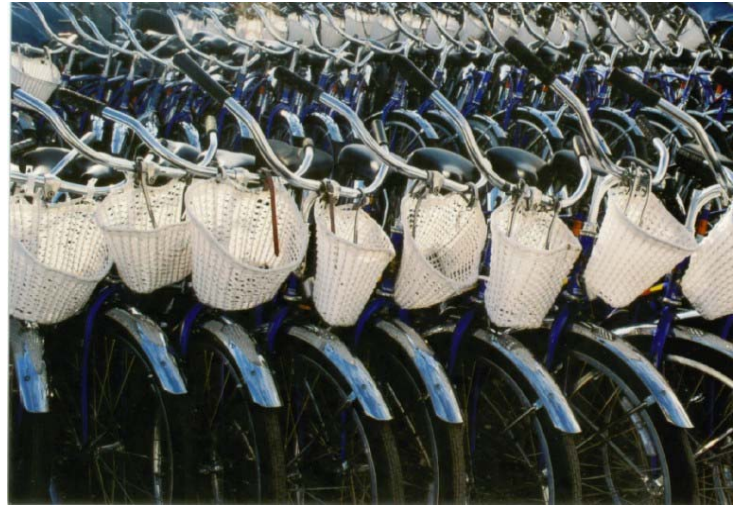
Bicycles on Mackinac Island

If you are not already a member, please consider joining the RAM Listserv. Its purpose is to provide a confidential forum for our members to discuss issues relevant to Michigan referees. This listserv is private and limited to member referees. It is secure from the eyes of non-referees (except, of course, the IT department of your County!). Only those persons who are current members of RAM and who have been approved by the list moderator may participate in the listserv. I encourage you to take advantage of this valuable resource today! Just send an email to pjacokesr@yahoo.com for instructions on how to join!