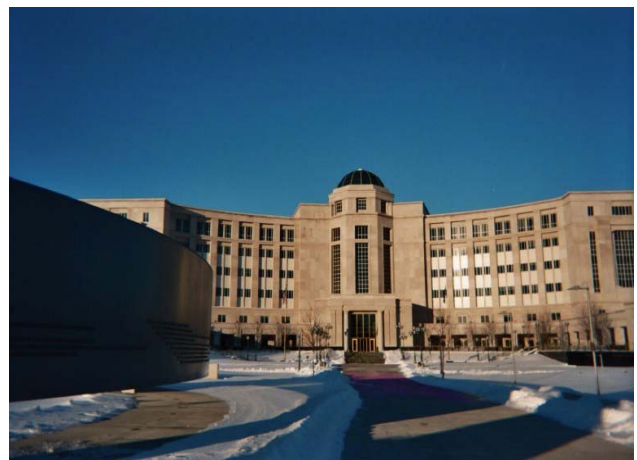
Michigan Hall of Justice, Lansing, Michigan